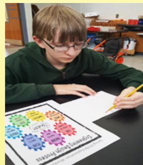
Engaged in the Engineering Design Process