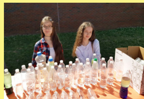
Georgia STEM Day — Investigating Density