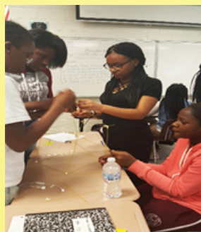
Marshmallow Challenge Engineering Design Process