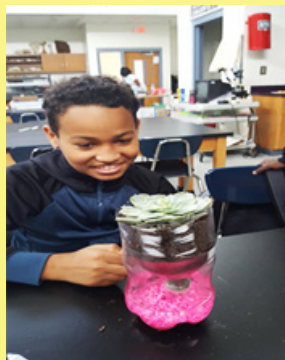
Exploring aquaponic and hydroponic systems