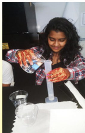
Conducting comparison analysis of cellulose fibers

Heritage High School Computer Graphic Visual Arts, Engineering Pathway Courses